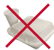
No Polystyrene Foam