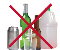
No Recycling No Liquids