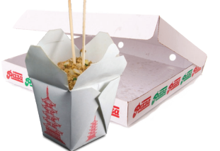
Food Scraps, Including Egg Shells, Meat & Bones, Pizza Boxes & Food-Soiled Paper, Coffee Grounds