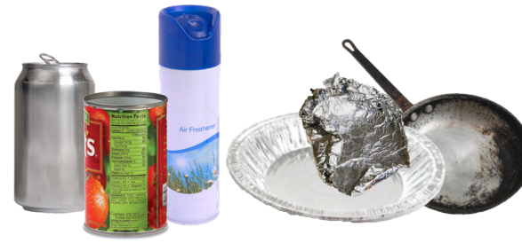
All Metal Beverage & Food Cans, Empty Aerosol Cans, Clean Aluminum Pans & Foil, Small Scrap Metal (Up To 20 Pounds)