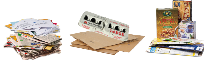
Clean Paper, Magazines, Newspaper, Junk Mail, Cardboard, Cardboard Egg Cartons, Cereal Boxes

Please do not bag recyclables, keep loose. Please empty all containers prior to recycling.