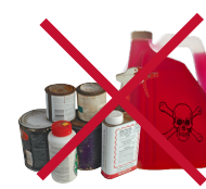
No Hazardous Waste Contact Yolo County at (800) 207-8222