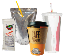
Condiments, Beverage Pouches, To-Go Soda and Coffee Cups