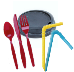
Cup Lids, Plastic Utensils, Plastic Straws (Including Compostable)