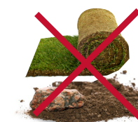
No Dirt, Rock, or Sod