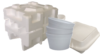
Polystyrene Foam & Packaging