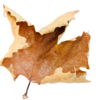
Grass, Weeds, Green Plants, Tree Limbs, Wood Chips, Dead Plants, Brush, Garden Trimmings, Leaves, Cut Flowers (Please place palm fronds, yucca and cacti in the Trash)