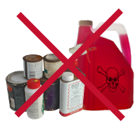
No Hazardous Waste Contact Yolo County at (800) 207-8222