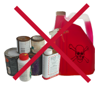
No Hazardous Waste Contact Yolo County at (800) 207-8222