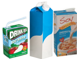
Gable-Top & Aseptic Cartons