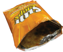
Snack & Chip Bags, Candy Wrappers